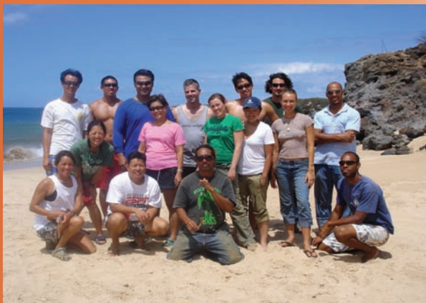
Pacific Century Fellows/Nature Conservancy restoration access, Sept. 10-13.

* The KIRC is a 170(c)(1), authorized, per IRS Publication 557, to receive tax-deductible contributions to programs, such as those listed above, that serve a public purpose. Donors should always consult with their tax advisors before claiming any tax-deductible charitable contributions.